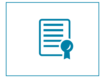
Focusing on high professional standards